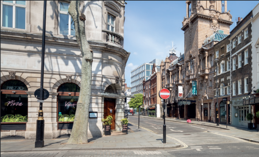
St Martin's Lane today